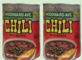
WOODWARD AVENUE CHILI 15 oz.