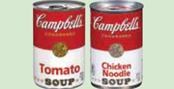
Campbell's CONDENSED SOUP Original TOMATO or CHICKEN NOODLE 10.75 oz.