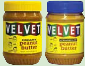
VELVET PEANUT BUTTER 18 oz.