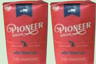
PIONEER BEET SUGAR 4 lb. bag