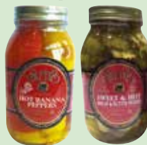
Safie's PICKLES, PEPPERS OR BEETS 26 oz.