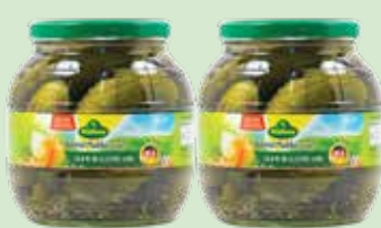
KUHNE PICKLE BARRELS 34.2 oz.