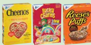
GENERALS MILL CEREAL CHEERIOS 8.9-9 oz., Lucky CHARMS 10.5 oz., REESE'S PEANUT BUTTER PUFFS 11.5 oz.