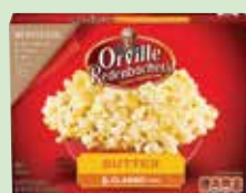
Orville REDENBACHER'S MICROWAVE POPCORN 6-12 ct.