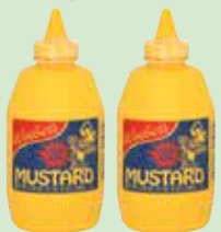
WOEBER'S YELLOW MUSTARD 24 oz.