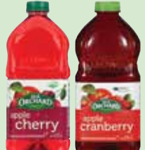
Old ORCHARD JUICE COCKTAILS 64 oz.