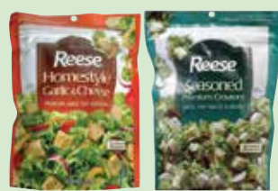
REESE CROUTONS 5-6 oz.