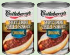
CASTLEBERRY'S HOT DOG CHILI SAUCE 10 oz.