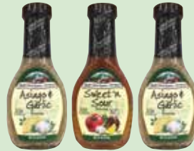
Maple GROVE FARMS DRESSING 8 oz.