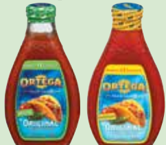
ORTEGA TACO SAUCE Mild or Medium • 16 oz.