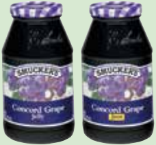
SMUCKER'S GRAPE JELLY OR JAM 32 oz.