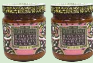
DESERT PEPPER SALSA 16 oz.