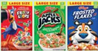
Kellogg's CEREAL Frosted Flakes 14.7 oz, Apple Jacks 14.7 oz., Frosted Flakes 19.2 oz., Corn Pops 14.6 oz., Rice Krispies 18 oz. or NutriGrain Bars 10.4-13 oz.