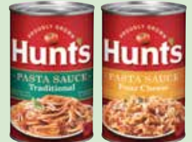
HUNT'S PASTA SAUCE 24 oz.