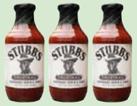
Stubb's BBQ SAUCE 18 oz. OR MARINADES 12 oz.